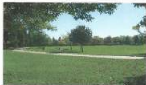
Beautiful Park nearby!