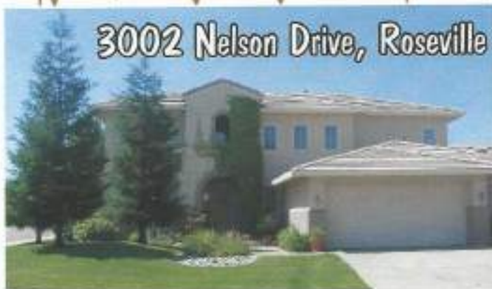
3002 Nelson Drive, Roseville