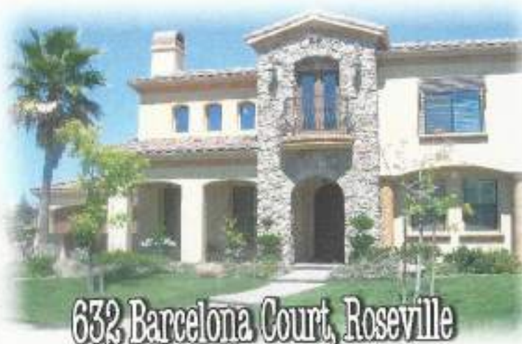
632 Barcelona Court, Roseville