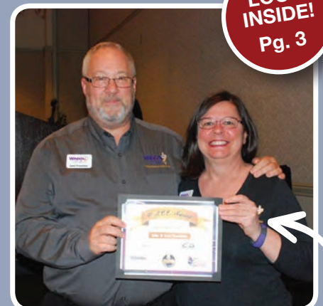
Networking Partner Spot Light