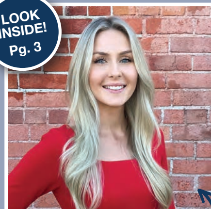
Team Member Spot Light!