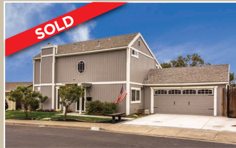
153 Dartmouth Place - Benicia Listed at $695,000