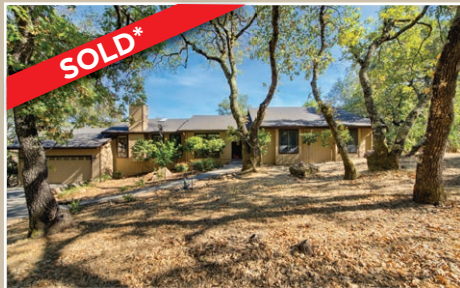
302 McTavish Court - Green Valley Highlands Listed at $859,000