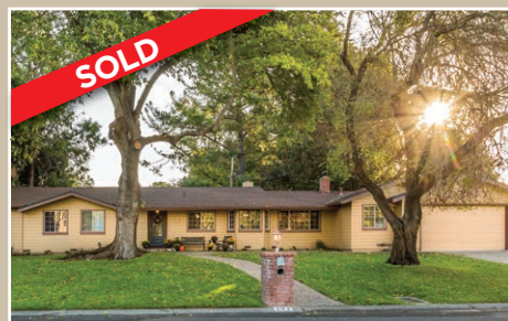
202 Paseo Arboles - Green Valley Estates Listed at $885,000