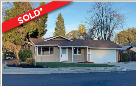
1503 Cherrywood Drive - Martinez Listed at $715,000