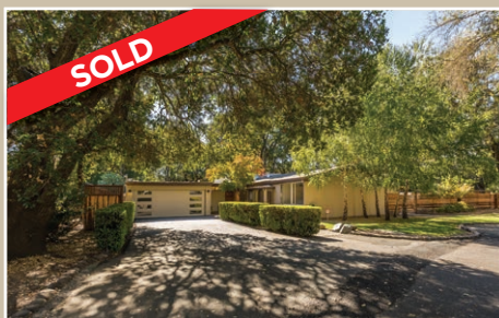
22 Country Club Drive - Green Valley Listed at $1,147,500