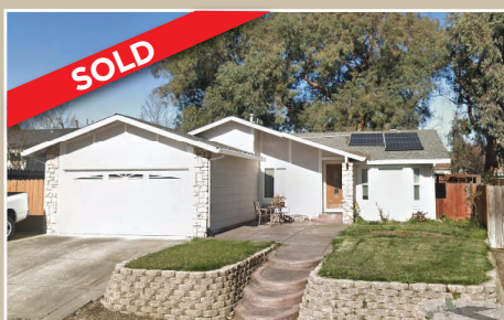
509 Silverado Circle - Cordelia Listed at $495,000