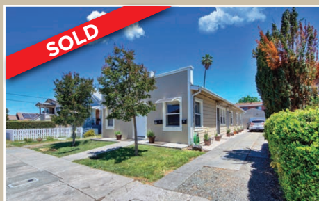
1802 Sutter Street - Vallejo Listed at $435,000