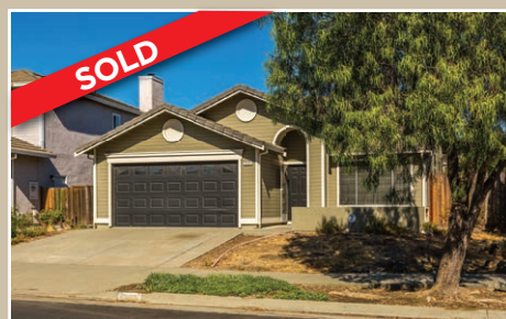
1392 Northwood Drive - Cordelia Listed $485,000