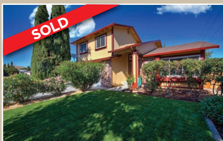
838 Brookdale Court - Cordelia Listed at $599,000