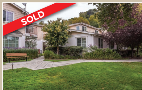
510 Entrada Drive #105 - Novato Listed at $559,000