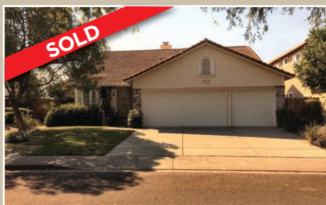
3163 Pine Valley Drive - Rancho Solano Listed at $599,000