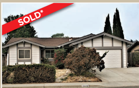
5016 Silverado Drive - Cordelia Listed at $465,000