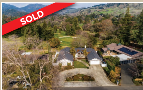
25 Country Club Drive - Green Valley Listed at $1,298,500

Our agents have been hard at work selling real estate in your community.