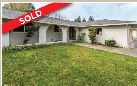
237 Daffodil Drive - Fairfield Listed at $475,000