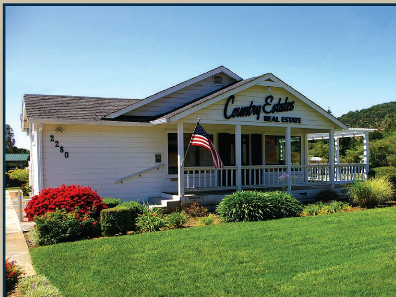
#1 Boutique Real Estate Office in Solano County

Country Estates is a Full Service Real Estate Office Staffed by Real Estate Professionals and Specializing in: