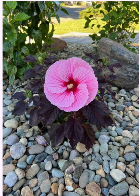
My Dinner Plate Hibiscus