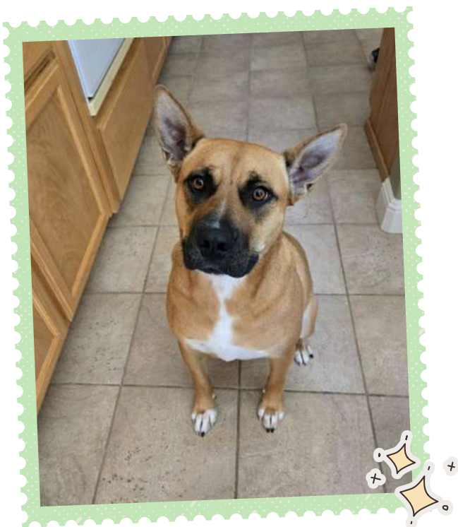
Happy to dog-sit for my grandson's dog, Sky.