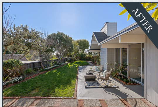
Yard Landscaping $800 - $3,500