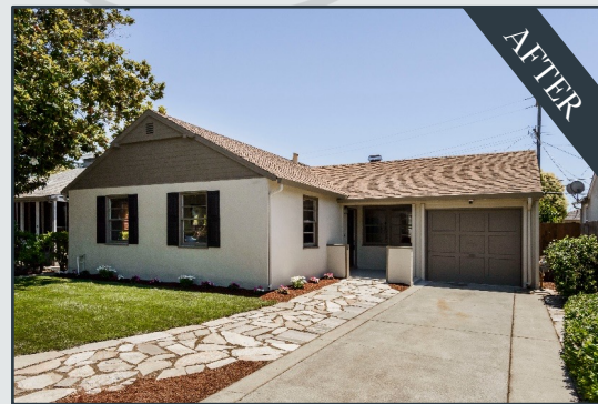
Exterior paint/touch up/trim approx. $1,500 - $4,000 & front landscaping approx. $1,000 - $3,500