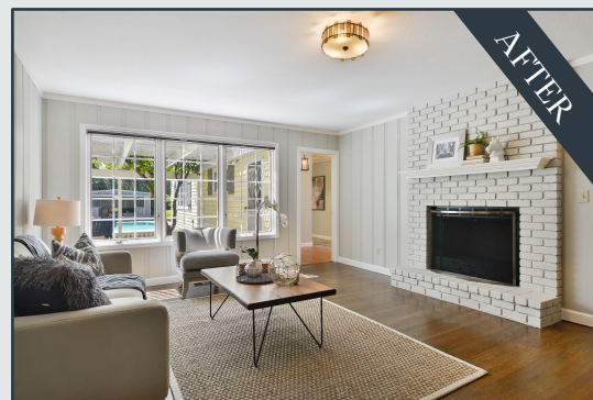
Full Interior paint approx. $3,000 - $7,000, carpet removal & refinish/stain hardwood flooring approx. $2100 - $4,500, new light fixtures and hardware throughout $750 - $1,500