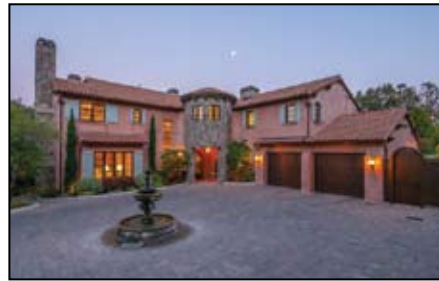
$6,000,000 ■ ■