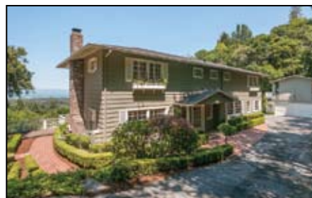
$3,200,000 ■ ■