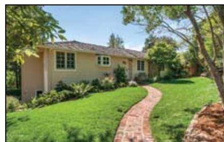
$2,775,000 ■ ■